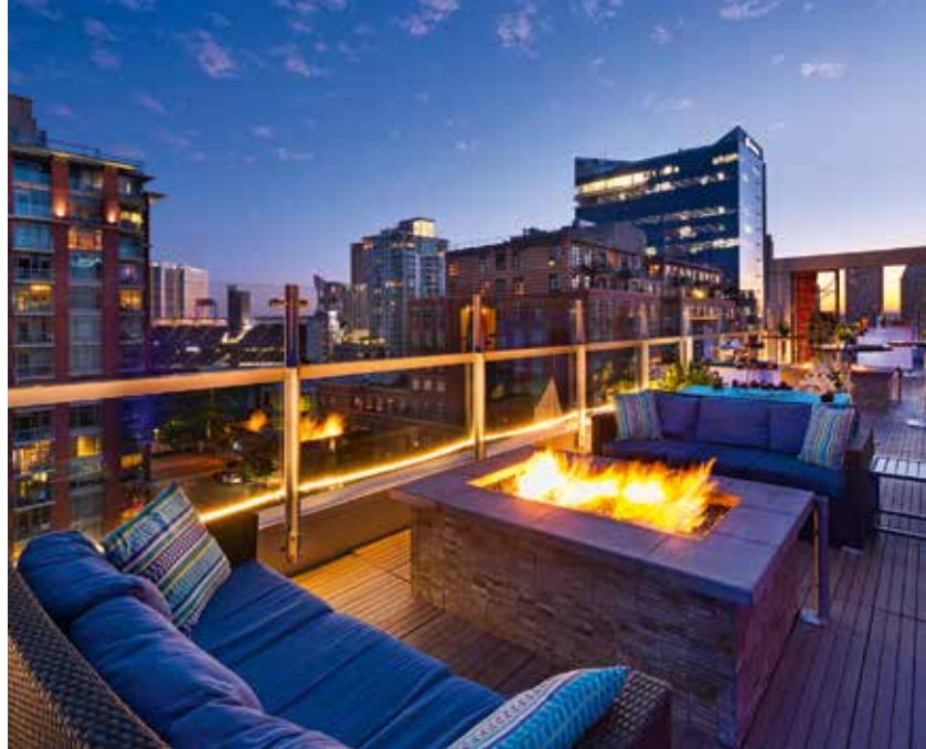
Above: Hotel Indigo's Level 9 bar offers great views across the Gaslamp Quarter